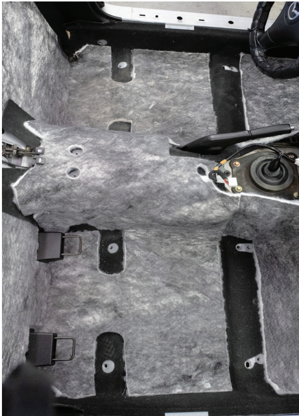
FIG. 3 LAY DOWN CENTER INSULATION ON CONSOLE AND UNDER DEAT AREAS (VIEW FROM DRIVERS DOOR)

STEP 3. Lay the new center insulation down under the seat area and center console. FIG 3