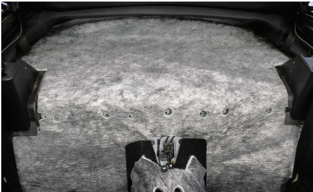
FIG. 4 LAY DOWN INSULATION ON REAR DECK AND BEHIND THE SEAT BULKHEAD

STEP 4. You can now lay the front factory carpet back into place.