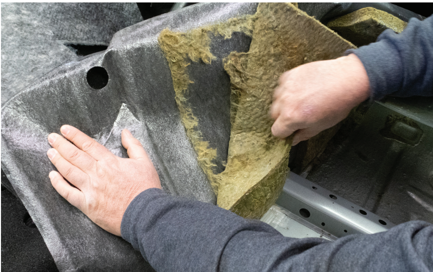
FIG. 1 PULL UP CARPET AND REMOVE FACTORY PADDING PASSENGER SIDE SHOWN (VIEW FROM PASSENGERS DOOR)

STEP 6. Remove screws holding center console in place.