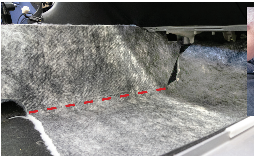
FIG. 2 LAY DOWN INSULATION PIECES ON FLOOR IN BOTH DRIVER AND PASSENGER FOOT WELL (INSULATION INSTALLED IF CHOOSING TO REMOVE CARPET) PASSENGER SIDE SHOWN (VIEW FROM PASSENGERS DOOR)

Make sure no carpet or insulation interferes with the operation of the gas, brake or clutch pedals.